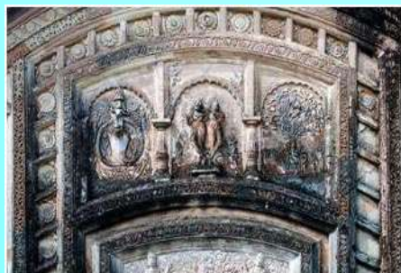
Stucco ornamentation of Bhavaniswar Temple

both the inner and outer walls contain intricate terracotta ornamentation depicting gods and goddesses along with mythological stories complete with floral patterns. Next to the Bhavaniswar Temple are two similar temples but much smaller in size. Sadly, the temples are in a crumbling stage with the plaster peeled off along with the ornamentation.