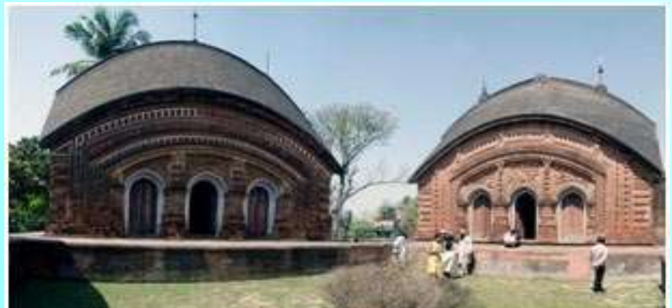
The Char Bangla Temple Complex

Baranagar has always lived under the shadows of its more famed counterpart, Murshidabad. It is located on the other side of the Bhagirathi River and also has its share of history. A series of amazing temples, complete with intricate stucco and terracotta