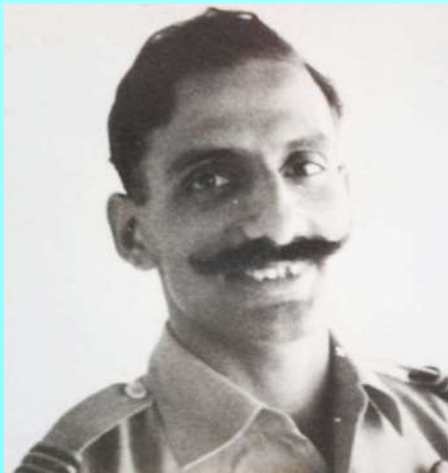
TT, Toothless terror

The R/T in Air Traffic Control crackled, "Blackjack Tower; One-Zero, Two Minutes". And there was panic! The SATCO had just enough time to respond "Call Overhead" before he grabbed his telephone and called up the Station Commander. In minutes, the news went round the Station. The AOC Operations Command was descending (literally) on us for an inspection.