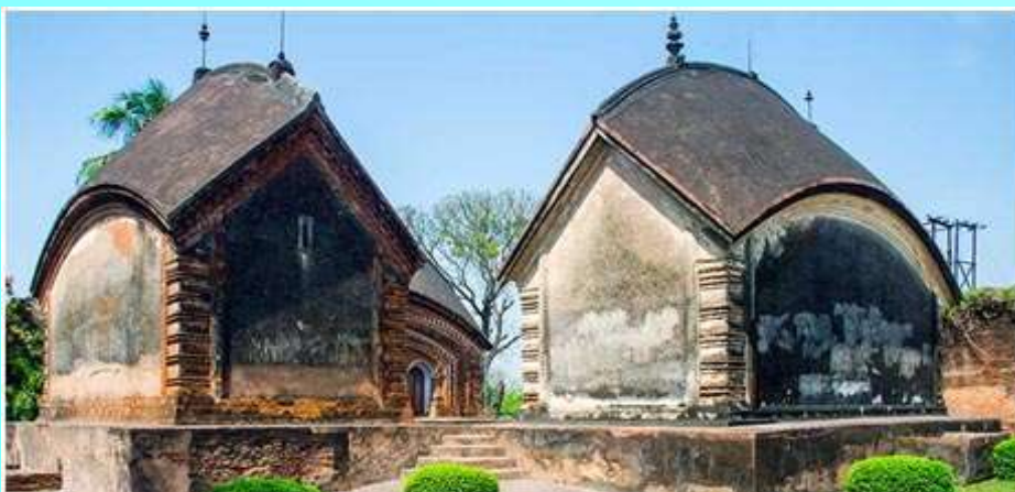
Another view of the Char Bangla Temple Complex

ornamentation, can well turn Baranagar into an add-on destination from Murshidabad.