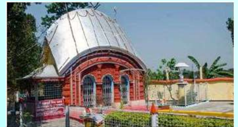
The Panchamukhi Temple

The last temple in Baranagar is the Panchamukhi temple. And as the name suggests, the Shivaling of the temple consists of five faces. It follows the typical do-chala style of architecture. It is an active temple and has been given a modern look.