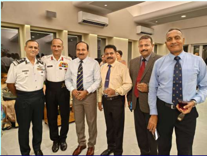
AF Day Party at ADV HQ on 08 October. ACM Arup Raha PVSM AVSM VM and AVM Rahul Bhasin VM, AOC ADV HQ along with Veterans