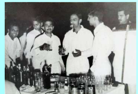
Behind the bar: Fourth from left

He then drove back to the squadron dispersal, had a few words with the Station Commander and Squadron Commander, in the latter's office, and then joined the officers in the Crew Room, for an informal chat and a glass of tea.