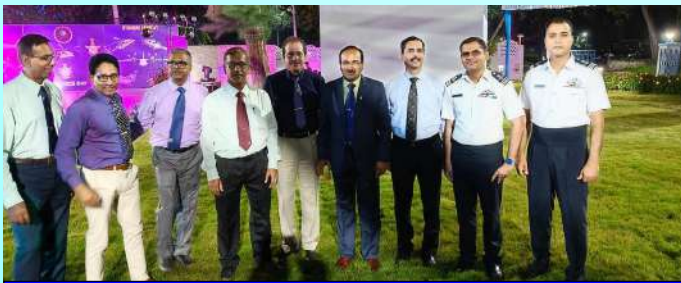
Social evening on AF Day AF Stn Barrackpore