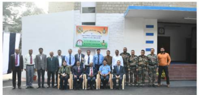
AFA KAR BRANCH: ORGANISING TEAM OF SAHAYATA SHIBIR