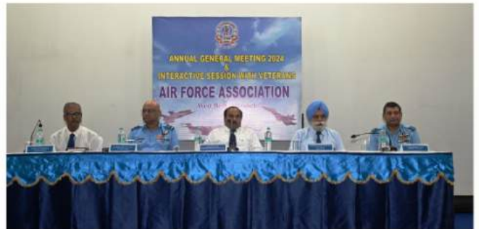
AT INTERACTIVE SESSION. PRESIDENT AFA WB BRANCH, DG ADM, CHIEF PATRON AFA WB BRANCH, SR VP AFA, STN CDR BKP.