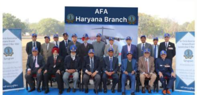
AFA HARYANA BRANCH: FELICITATION OF OCTOGENERIANS & NONAGENERAIANS