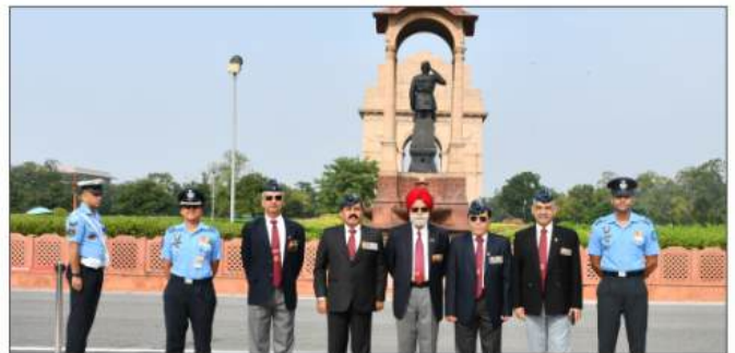
TEAM AFA WITH PRESIDENT AT NWM ON AFA RAISING DAY