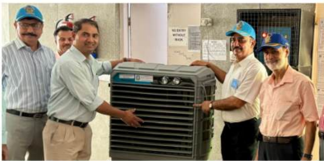
TEAM AFA DONATES AIR COOLERS TO ECHS NOIDA