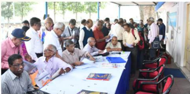
AFA KAR BRANCH: SPARSH SAHAYATA SHIBIR