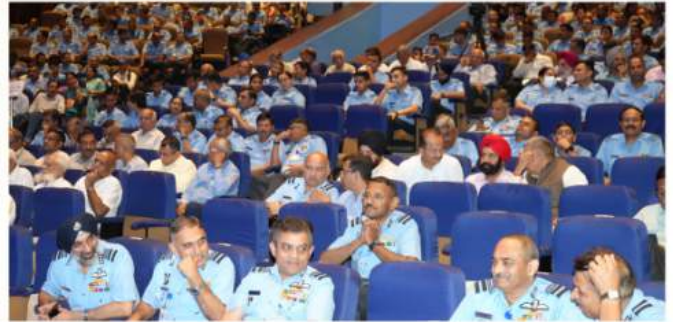
AUDIENCE AT AIR FORCE AUDITORIUM ATTENDING THE LECTURE