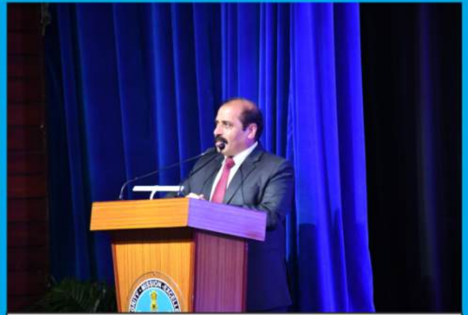
PRESIDENT AFA ADDRESSING VETERANS AT AFA RAISING DAY