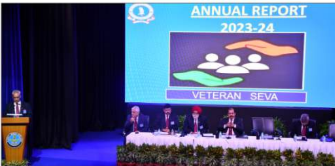
PRESENTATION OF ANNUAL REPORT BY VP ON AGM 2024