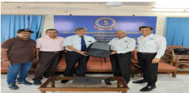
AFA MAHARASHTRA RECEIVING LAPTOP FROM SHRO SYSTEM