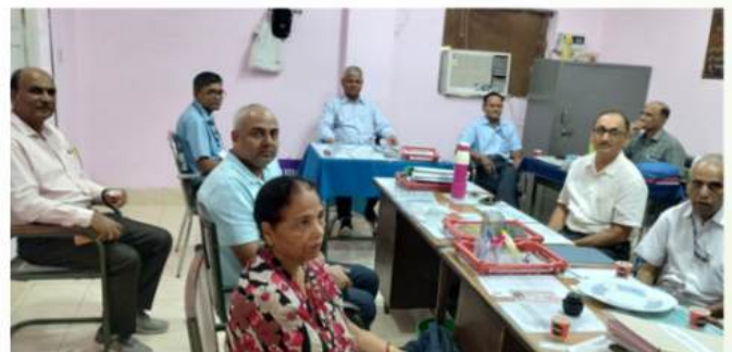
AFA UP BRANCH : EXECUTIVE COMMITTEE MEETING