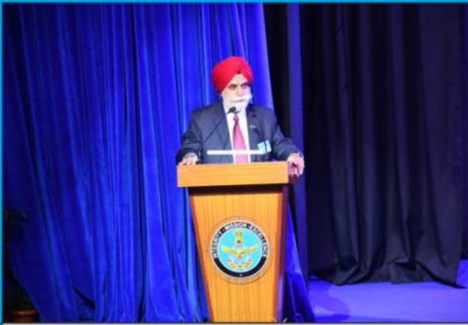
SR VICE PRESIDENT AFA ADDRESSING VETERANS AT AFA RAISING DAY