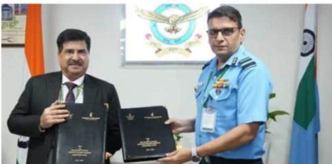
IAF SIGNED MOU WITH PUNJAB & SINDH BANK FOR DEFENCE SALARY PACKAGE ACCOUNTS