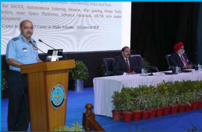
CAS ADDRESSING AUDIENCE ON AFA RAISING DAY