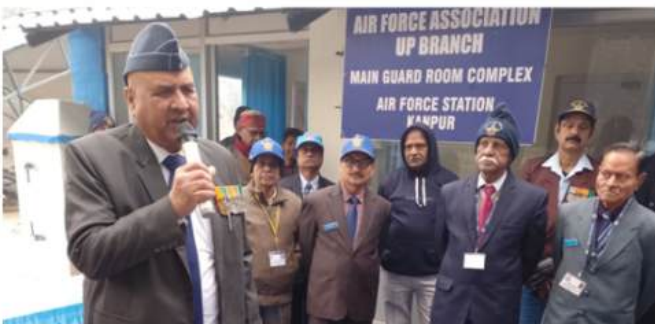
AFA UP BRANCH (KANPUR) WELCOME SPEECH BY PRESIDENT