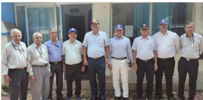
REP OF AFA LUCKNOW VISIT AFA KANPUR