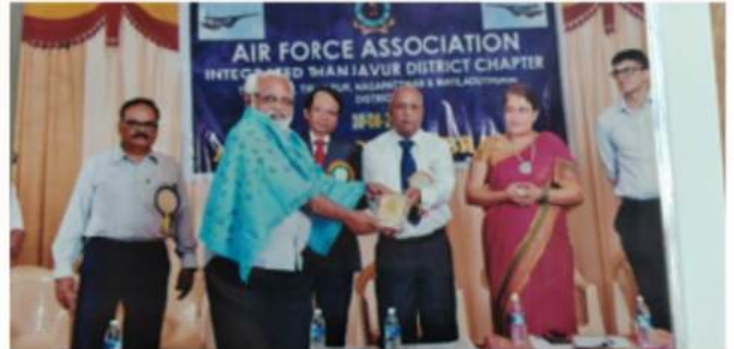
AFA TN BRANCH: FELICITATION OF VETERANS AT THANJAVUR CHAPTER