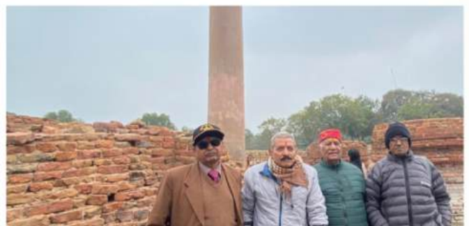
AFA BIHAR BRANCH: PICNIC AT VAISHALI