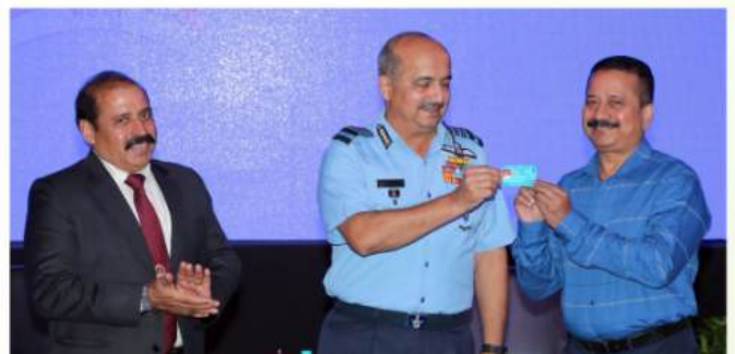
CAS RELEASING ID CARD FOR RETIRED AIRMEN