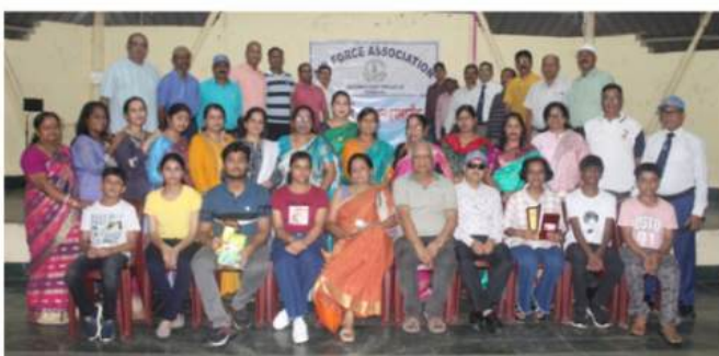
AFA JHARKHAND BRANCH: VIDYARTHI SAMMAN SAMAROH