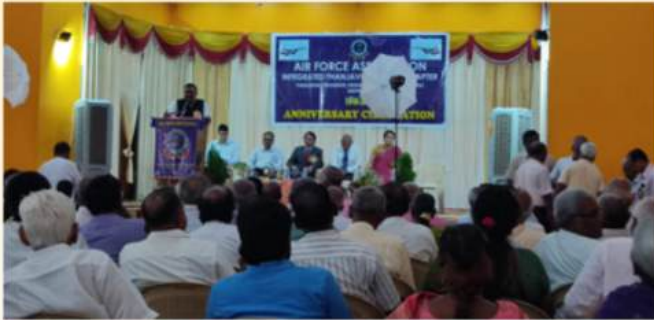
ANNIVERSARY CELEBRATION - AFA THANJAVUR CHAPTER