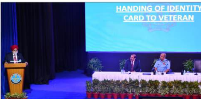
RELEASE OF IDENTITY CARD FOR AIR WARRIORS ON RETIREMENT