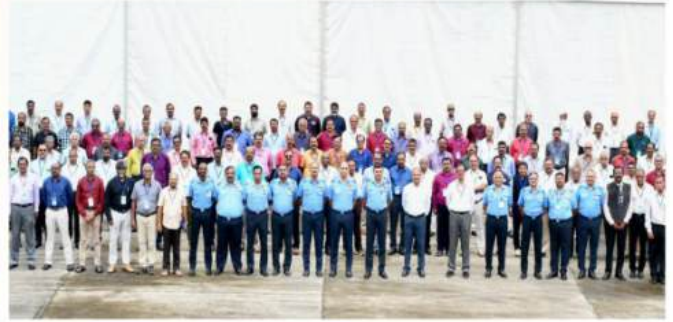
AFA KERALA BRANCH GET TOGETHER