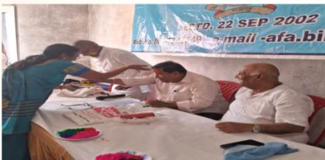
AFA BIHAR BRANCH: HOLI MILAN CELEBRATIONS