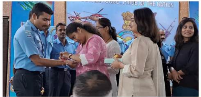
AFA MP BRANCH: RAKHI CELEBRATIONS