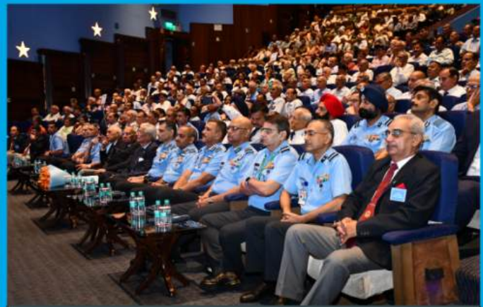
AUDIENCE ON AFA RAISING DAY AT AF AUDITORIUM