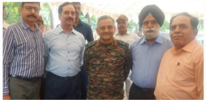
TEAM AFA WITH CDS