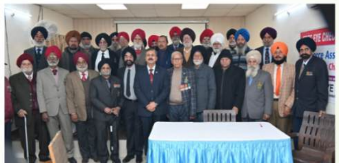
VETERANS DAY CELEBRATION AT AMRITSAR CHAPTER