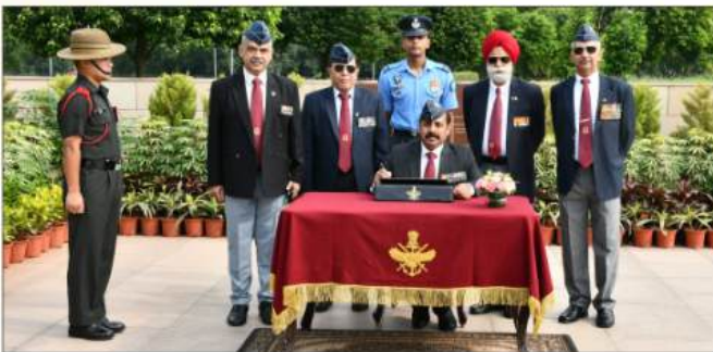
SIGNING OF VISITORS BOOK BY PRESIDENT AFA AT NWM