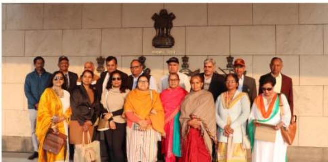
AFA HARYANA BRANCH: VISIT TO NATIONAL WAR MEMORIAL