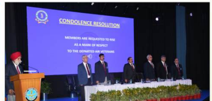
VETERANS OBSERVE TWO MINUTES SILENCE FOR DEPARTED SOULS AT AFA RAISING DAY