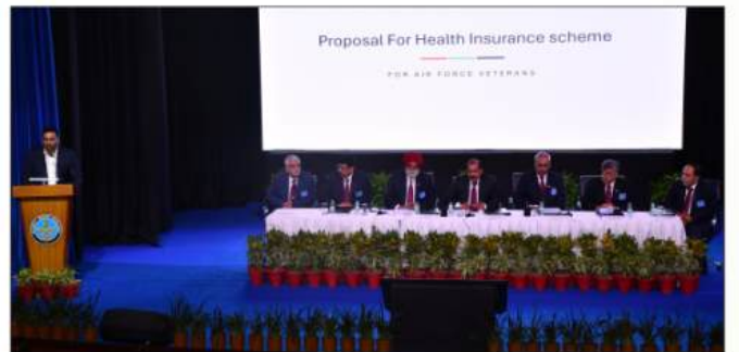
LAUNCH OF GROUP HEALTH INSURANCE SCHEME BY AFGIS / ALLIANCE AT AFA RAISING DAY