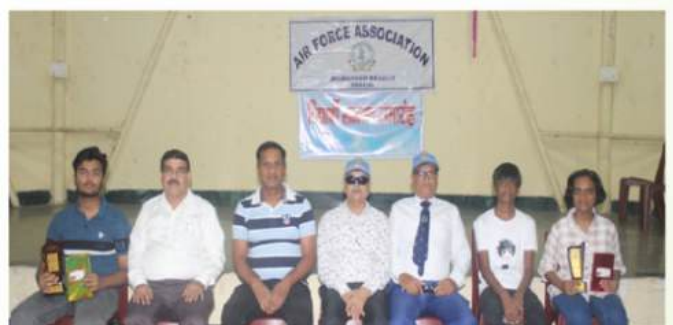
AFA JHARKHAND BRANCH COMMITTEE MEMBERS ALONG WITH PRIZE WINNERS