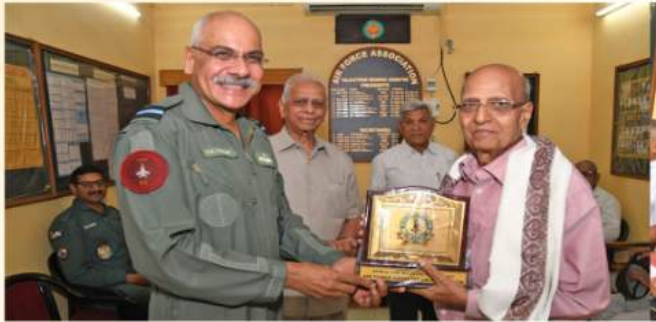
AFA RAJ BRANCH: HONOURING OCTOGENARIAN MEMBERS