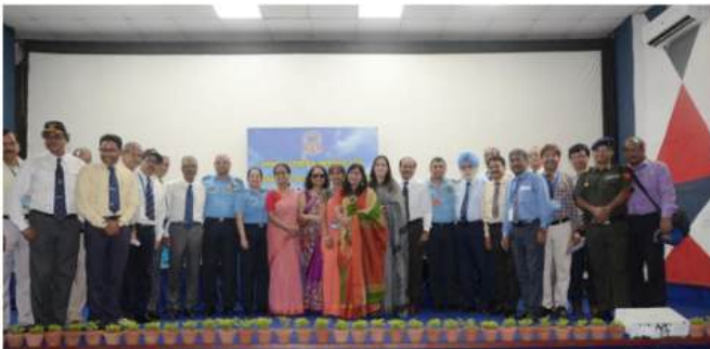
AFA WB BRANCH: VETERANS INTERACTIVE SESSION