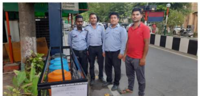
INSTALLATION OF JAL PIAAU BY AFA NOIDA