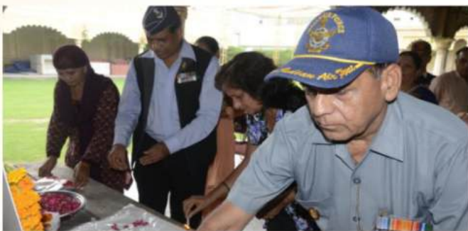
AFA GHAZIABAD CHAPTER: KARGIL VIJAY DIWAS CELEBRATION