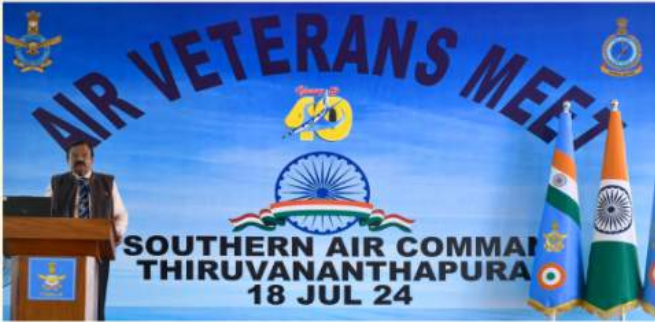
VETERAN MEET AT AFA KERALA BRANCH