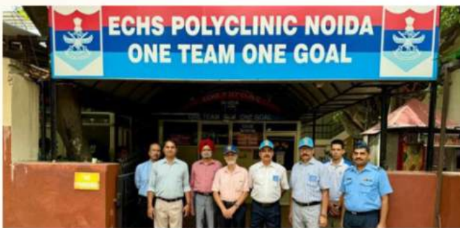
TEAM AFA VISITS ECHS NOIDA