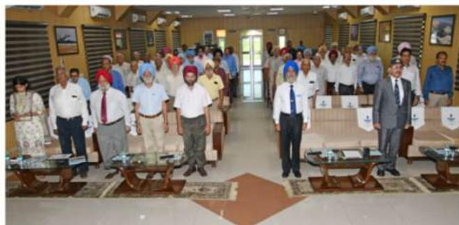
NZ BRANCH: AGM AT CHANDIGARH