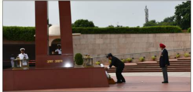
WREATH LAYING CEREMONY AT NWM ON AFA RAISING DAY