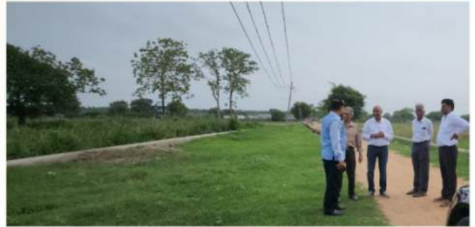
PROPOSED SCH SITE AT HYDERABAD