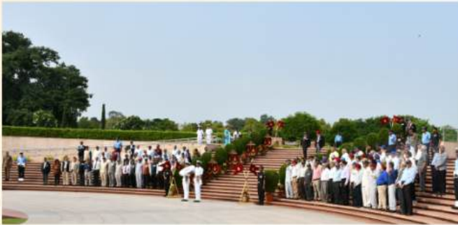
VETERANS AT NWM FOR WREATH LAYING CEREMONY ON AFA RAISING DAY