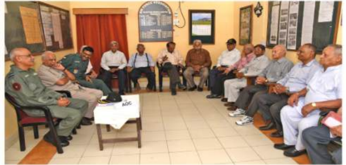
AFA RAJ BRANCH: OCTOGENARIAN CEREMONY COMMITTEE