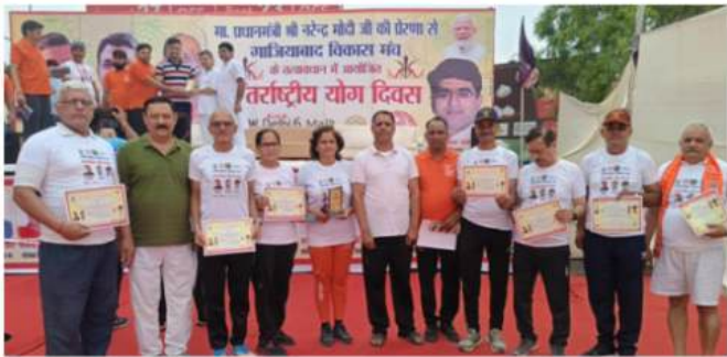
AFA GHAZIABAD : INTERNATIONAL YOGA DIWAS CELEBRATIONS